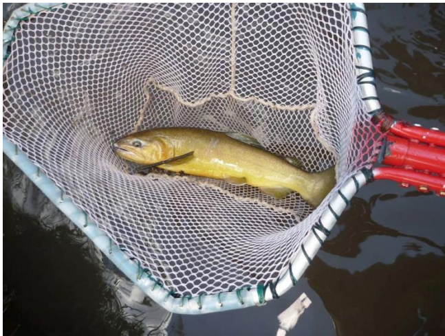
Large adult Gila Trout sampled in Willow Creek