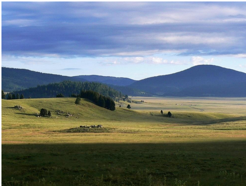
Valles Caldera overview from NM Hwy 4

ment in 2000 for $97 million, with monies from the Land and Water Conservation Fund. As part of the purchase agreement, a provision was included by former NM Senator Domenici that the land would be managed not by federal agencies, but by a board of trustees made up of private citizens appointed by the President. It was hoped by some that this experiment in private management of public lands would provide a model of how to reduce the need for the BLM and