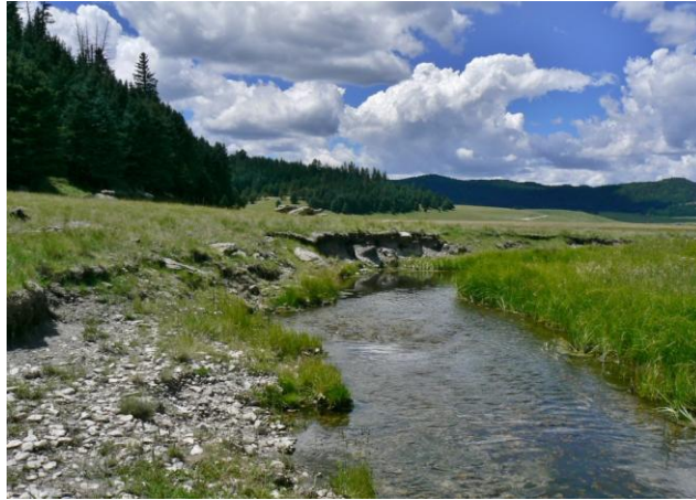
San Antonio Creek

Within the Valles Caldera, both San Antonio Creek and the East Fork of the Jemez have the character of alpine meadow streams. Especially the East Fork is very narrow but surprisingly deep; it is possible to step across it in the headwaters area, and it has the feeling of a marsh, with its narrow channel meandering through thick stands of tall grass. The San Antonio is almost as narrow in some of the upper reaches, but much more open in lower sections (see photos). Both streams contain wild brown trout, and the East Fork has rainbows as well. They are not especially picky when it comes to fly selection. The main challenge is precision casting under challenging conditions, those small waters skills again. The streams present a target often only a yard or so wide, and a missed cast to either side will get you snagged in the tall grass. If it is breezy or windy, hitting the water and missing the grass is even more challenging. The water is often pretty shallow, so the fish can be