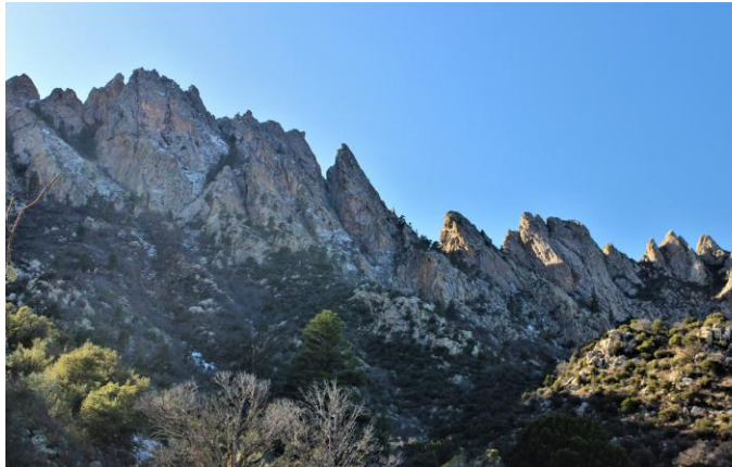
Organ Mountains near Aquirre Springs

More recently, some monuments have been designated to protect multiple resources, and multiple types of resources, rather than just a single site. So, for example, Bears Ears National Monument is helping to preserve many archaeological sites and Native American sacred areas, as well as prominent geological formations. But in addition, it is also “ensuring continued access to some of the best elk hunting, not just in the state, but the world” (Chris Carling, media representative for the Western Hunting and Conservation Expo). In our area, the Organ Mountains–Desert Peaks National Monument protects literally thousands of archaeological sites and many holy sites that are sacred to the Mescalero Apaches, the Piro–Manso–Tiwas, and other Native Americans in the region. Some recently designated national monuments even contain excellent opportunities for fly fishing, such as