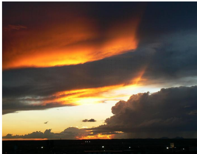
Sunset over the Organ Mountains–Desert Peaks National Monument with Mt. Riley in the distance