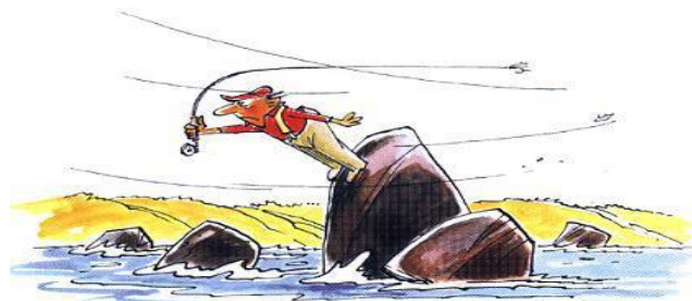
The charms of angling; Gentle breezes.