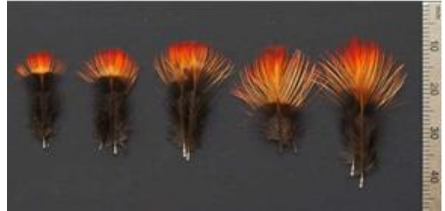
Indian Crow (Pyroderus) feathers for sale on eBay

involved. It seems that most of the elite tiers don't actually fish, at least not with the Victorian flies they dress; instead, their creations are viewed as works of art. There is also a pervasive belief within their ranks that authentic designs require the use of exotic feathers, even if it is illegal to sell and/or possess them.