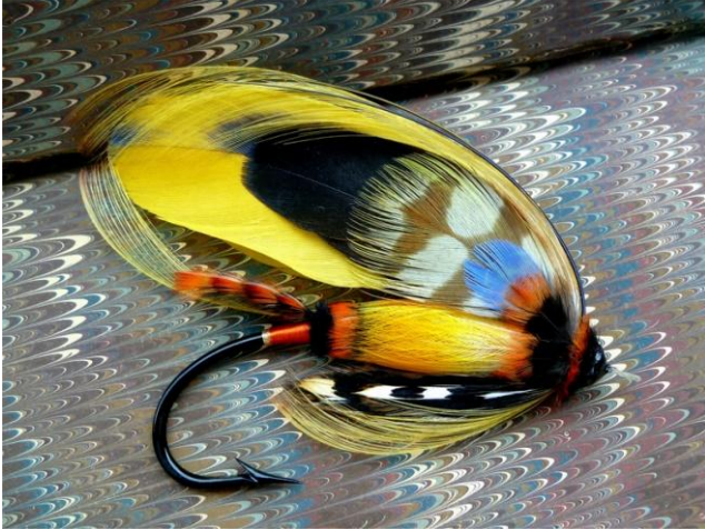
Wentworth Reflection by Luc Couturier

Museum. The case is the largest ever heist of animal specimens from a museum, and it has greatly impacted the scientific research significance of the largest such collection in the world. The feather thief focused on those rare and endangered species whose feathers are most coveted by elite fly tiers, including Cotingas, Indian Fruit Crow, Resplendent Quetzal, Birds of Paradise and Cock of the Rock. Among the