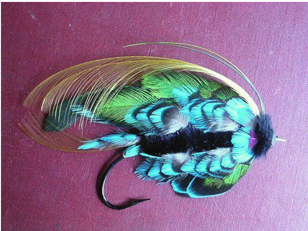
Cotinga and Quetzal pattern, Luc Couturier

stolen specimens were many that had been collected in the 1850s by Alfred Russel Wallace, co-discoverer of the principle of natural selection. (The chapter devoted to his career is fascinating in its own right.)