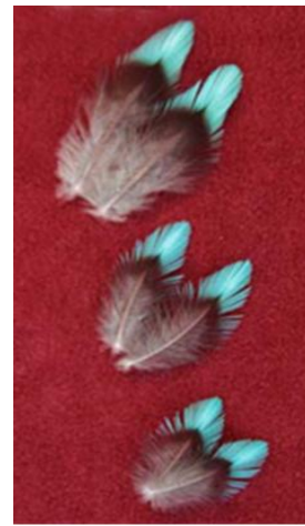
Cotinga cayana feathers for sale on eBay

Some years ago we heard a great hue and cry about the impacts to our sport/hobby as a result of hair stylists buying up quantities of hackle feathers to weave into their clients' hairdos, but there was no such outrage from the fly tiers about the theft of