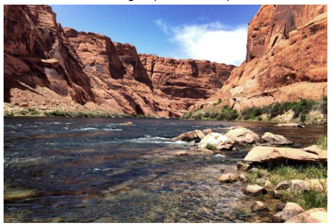
Colorado River in the Grand Canyon near Lee's Ferry For decades, LWCF has been the go-to tool to implement public lands conservation and facilitate access to outdoor recreation in this

How strong a consensus was reached in Congress? Very strong. Amazingly strong! In the Senate, the bill passed by a vote of 92-8. Both New Mexico senators voted for the measure. In the House of Representatives, the vote was 363 for and 62 against, with all three New Mexico house members voting in favor. All the nay votes in both chambers came from GOP side of the aisle, including 5 from Oklahoma and 15 from Texas where the mineral extraction industries pushed back against a bill even as bipartisan and popular as this one. The next step is to send the final bill to the White House for the president's signature. Let's hope that the overwhelming support for the noncontroversial bill will lead to its timely signing. There are many conservation projects that have been on hold since the funding expired last September.