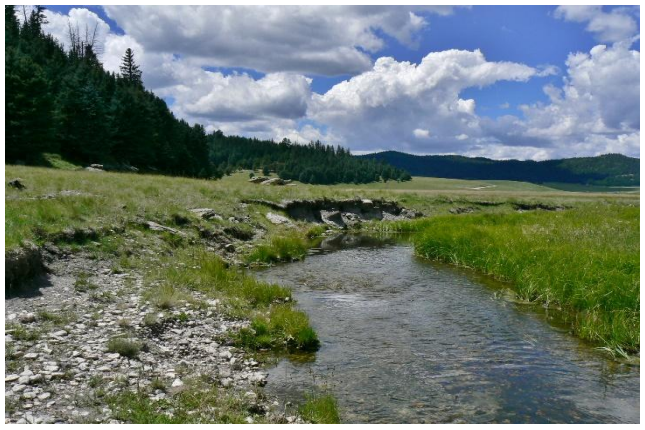
Valles Caldera National Preserve