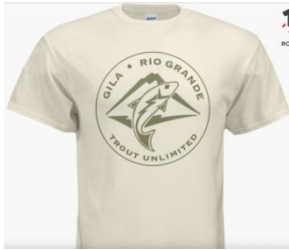
Green logo on ivory

sents for the holidays! Contact Jeff Arterburn for more details and to sign up as a volunteer: jeffgilatu@aol.com .