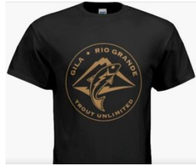
Peanut butter logo on black