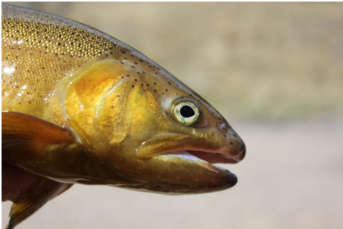
A Gila trout "selfie"