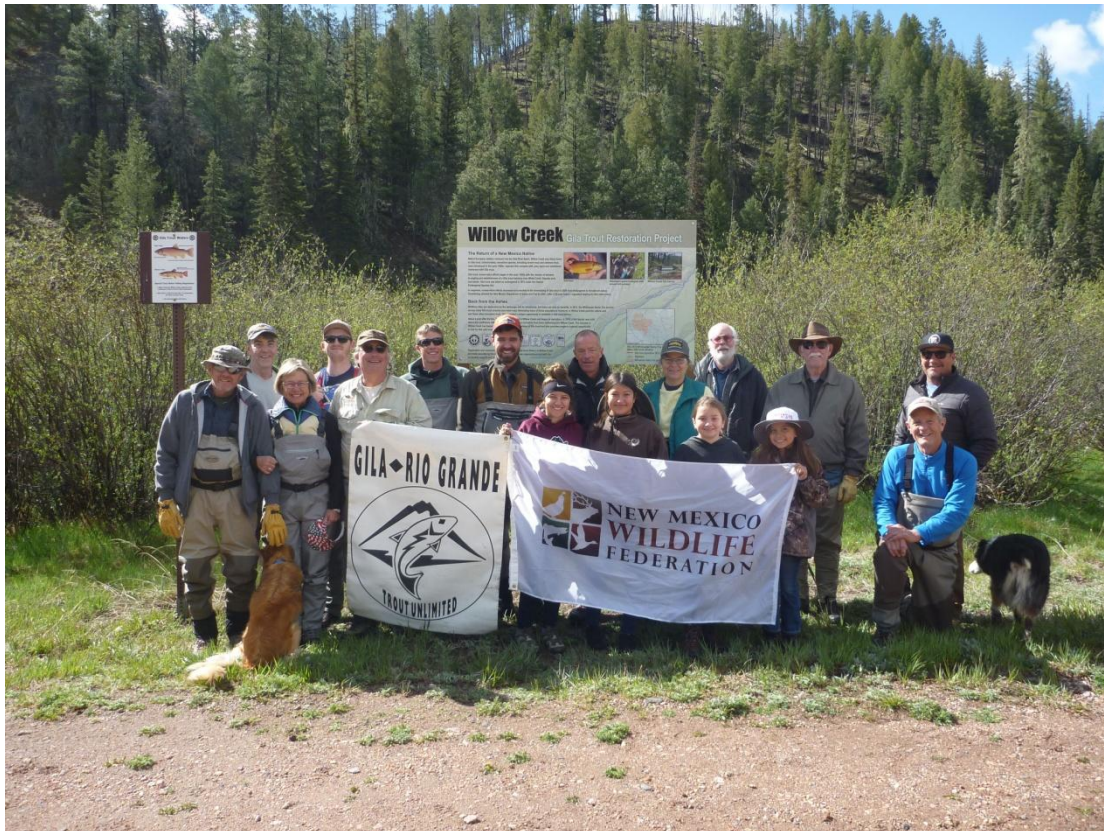
Stream Survey Volunteers at Willow Creek, Gila National Forest, Catron County NM, May 2019