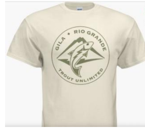
Green logo on ivory

You can help support our native trout conservation/restoration and outreach/education efforts by purchasing one of our beautiful T-shirts with the GRG-TU logo. We have two colors available: green-on-ivory, and peanut-butter-on black. These are great looking, well-made shirts for a great cause at only $20 each. Please include $5 for shipping if you want the shirt(s) mailed. Contact Jeff Arterburn to get yours, and to sign up for the next volunteer event: jeffgilatu@aol.com .