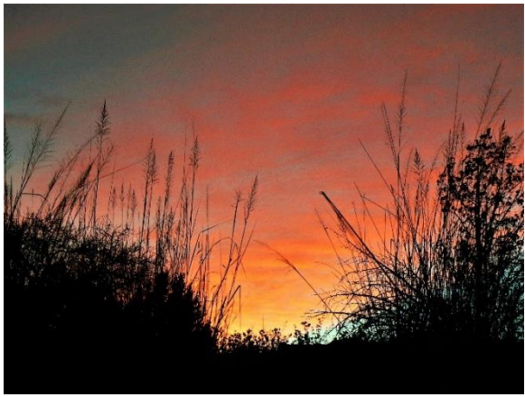
Rio Peñasco sunset

november-2020?utm_campaign=VIDEO%20SE-RIES%3A%20Trouts%20Tips%20%7C%20Start-ing%20Off%20in%20Fly%20Fishing%20%28UnZ-BgR%29&utm_medium=email&utm_so)___If you look closely, you'll see several good examples of how to mend line on long drifts while nymphing. And, you gotta love those drone shots of hooking and landing trout! Almost makes me want to get a drone and learn that kind of photography, but then, that would leave less time for fishing. Most of these sorts of videos are shot by videographers who don't often seem to get to fish themselves. Anyway, check it out. And remember to contact us about joining the board next year.