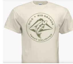
Green logo on ivory

Our beautiful T-shirts with the GRG-TU logo in colors: green-on-ivory, and peanut-butter-on-black are sold as part of our fund-raising for trout restoration and conservation efforts. These are great looking, well-made shirts for a great cause at only $20 each. Please include $5 for shipping if you want the shirt(s) mailed. Contact Jeff Arterburn to get yours, and to sign up for the next volunteer event: mailto:jeffgilatu@aol.com .