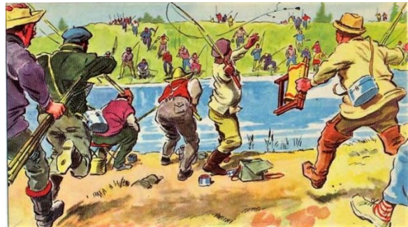
Ahh... the joys of a quiet day on the river...

Fly Fishers International (FFI) has announced that their annual International Fly Fishing Expo will be a virtual event this year, running from November 5–7, 2021. [Join Us for the Fly Fishing Event of the Year (mailchi.mp)] The event will include workshops, classes and presentations on all aspects of fly fishing, as well as conservation efforts from around the world. Even though we are doing pretty well with COVID vaccinations in our region, such is not the case in most of the world, especially in remote, less developed countries where many anglers travel abroad. This will be the first time the event will be made available online, so those of us who might have been interested but couldn't travel to attend the event in person can now see the content via the Internet. Check out the link for content details, and save the dates.