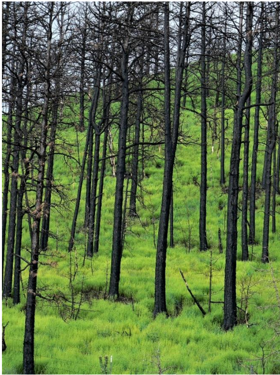
Area of forest burned by the 2012 Little Bear fire north of Ruidoso that has yet to see recovery of tree species.

determined, so it is quite possible that some were the result of human carelessness, rather than lightning strikes.