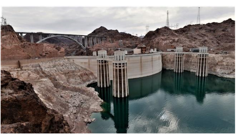
Record low water level in Lake Mead behind Hoover Dam

struck me as somewhat odd that some of our largest western cities are located in the middle of deserts with severely limited water sources. And while the infrastructure that moves water from places that have it to those which don't are pretty