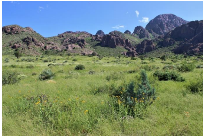
Organ Mountain foothills in Soledad Canyon, (8/29/2021)