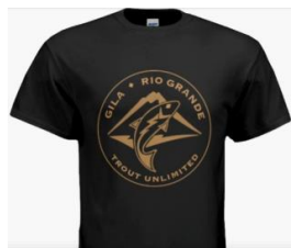
Peanut butter logo on black

If you are a current or former TU member looking