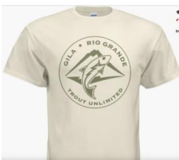
Green logo on ivory

Our beautiful T-shirts with the GRG-TU logo in colors: green-on-ivory, and peanut-butter-on-black are sold as part of our fund-raising for trout restoration and conservation efforts. These are great looking, well-made shirts for a great cause at only $20 each. Please include $5 for shipping if you want the shirt(s) mailed. Contact Jeff Arterburn to get yours, and to sign up for the next volunteer event: mailto:jeffgilatu@aol.com .