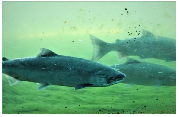
Sockeye salmon swimming past the viewing window as they traverse the fish ladder.

The ladder was rebuilt in 1976 to reduce the injury of salmon from the locks, boats, and predators, such as harbor seals and sea lions. Nevertheless, the seals learned to intercept the salmon at the entrance of the fish ladder, with some actually swimming into the first step of the ladder and simply picking off the salmon as they entered