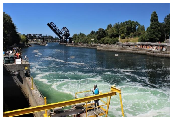
Ballard locks at right, fish ladder in lower left corner. The woman on the yellow scaffolding is monitoring the movement of harbor seals, releasing noise bombs when seals swim too close to the fish ladder inlet.

boat traffic than any other locks in the country. When the ship canal was built, the historic salmon runs in the Duwamish River were destroyed, so a new run was established using stocked salmon from Baker River to the north. As fish ladders go, the Ballard version is unique because it traverses the salt water to fresh water transition, while others are just at dams in fresh water. Fresh water flowing into the embayment below the locks attracts the salmon into the ladder and on their way to Lake Washington and its tributaries.