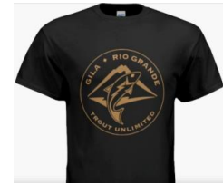
Peanut butter logo on black

If you are a current or former TU member looking to renew your membership please use the standard renewal form on the TU website: https://www.tu.org/trout-unlimited-3/ or call 1-800-834-2419.