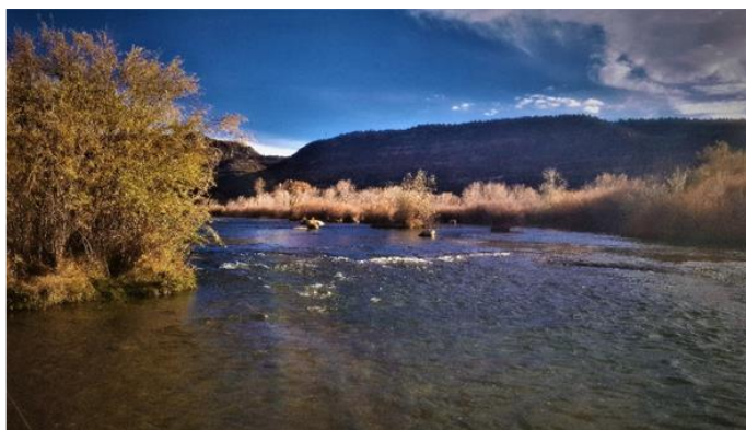
A gorgeous fall afternoon wading the Braids area, San Juan River

Above Texas Hole, many familiar beaver lodges have been swept away, and a number of deep runs and holes have been filled with gravel and silt. There have been changes in the area of Last Chance Riffles too. The state has developed a major day use picnic area and river access at Crusher Hole, extending upstream almost to Durrangler's Corner. That entire area was overrun by anglers, and Last Chance, once my favorite spot to wade, has slipped well down on my go-to list. In case you haven't heard, the founder of Abe's Motel and Fly Shop passed in April of 2019, and