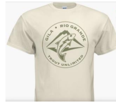
Green logo on ivory