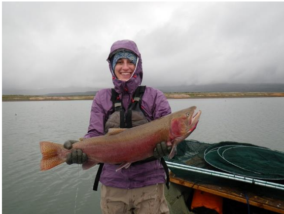
Lahontan Cutthroat trout at Summit Lake, on the reservation of the Summit Lake Paiute Tribe

The Lahontan Cutthroat is the only trout species native to the Tahoe Basin, and it is also the largest cutthroat species in the world. http://westernnativetrout.org/lahontan-cutthroat-trout/ The species is listed as threatened, because of damage to spawning habitat by pollution, logging, water diversions, over fishing, and the introduction of non-native species. Its reintroduction is important to anglers, scientists, the Washoe Tribe of Native Americans, conservationists, and proponents of the outdoor recreation economy.