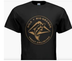
Peanut butter logo on black

Our beautiful T-shirts with the GRG-TU logo in colors: green-on-ivory, and peanut-butter-on-black are sold as part of our fund-raising for trout restoration and conservation efforts. These are great looking, well-made shirts for a great cause at only $20 each. Please include $5 for shipping if you want the shirt(s) mailed. Contact Jeff Arterburn to get yours, and to sign up for the next volunteer event: mailto:jeffgilatu@aol.com .