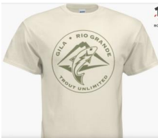
Green logo on ivory

GRG-TU Logo T-shirts to support local trout restoration and conservation efforts.