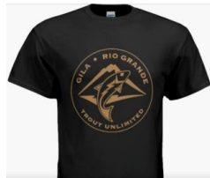
Peanut butter logo on black

Our beautiful T-shirts with the GRG-TU logo in colors: green-on-ivory, and peanut-butter-on-black are sold as part of our fund-raising for trout restoration and conservation efforts. These are great looking, well-made shirts for a great cause at only $20 each. Please include $5 for shipping if you want the shirt(s) mailed. Contact Jeff Arterburn to get yours, and to sign up for the next volunteer event: mailto:jeffgilatu@aol.com .