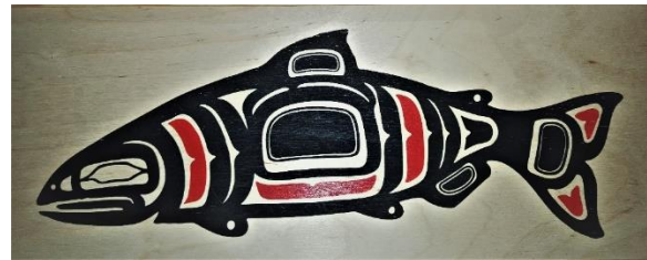
Haida Gwaii (Native American) sockeye salmon totem

vastly exceeding last year's record of 67.7 million. This year has seen the largest commercial harvest of sockeye since the onset of commercial fishing in Bristol Bay in 1883. These numbers, and the management success they represent, underscore the need to protect the most productive sockeye fishery in the world from the polluting effects of mining in the Bristol Bay headwaters. [ Record Number of Salmon Return to Alaska's Bristol Bay | Outdoor Life ]. The EPA is considering implementing the watershed protections that were developed after extensive scientific studies and community outreach in both 2014 and 2021. The period for the public to comment on the proposed protections has been extended until September 6, 2022. I invite club members to make their voices heard, and the EPA has provided this link where you can submit comments. [ Public Comments and Hearings on the 2022 Proposed Determination | US EPA ]