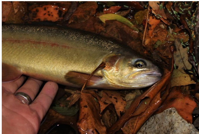
Gila Trout, Whitewater Creek, Gila National Forest

when I was perhaps five years old, but I didn't discover fly angling and fly tying until the 6 th grade. I still sometimes fish with conventional tackle, and I have hanging in my office a replica mount of 32", 14.5 lb. walleye that I caught and released in Trout Lake, Ontario, using conventional tackle. I understand the excitement of catching a large and challenging fish. What I don't understand is lying about one's fishing exploits. I know there are lots of jokes about anglers telling lies; John Gierach has even written a book titled "All Fishermen are Liars." I have chosen to believe that most of us are not, and have generally shrugged off such claims as jokes. But I have to admit, I was pretty shocked to read that two anglers competing in the Lake Erie Walleye Trail (LEWT) Series championship tournament were disqualified for cheating. They stuffed about 8 lbs. of large egg sinkers and