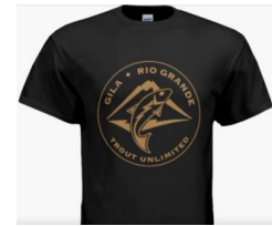
Peanut butter logo on black

Our beautiful T-shirts with the GRG-TU logo in colors: green-on-ivory, and peanut-butter-on-black are sold as part of our fund-raising for trout restoration and conservation efforts. These are great looking, well-made shirts for a great cause at only $20 each. Please include $5 for shipping if you want the shirt(s) mailed. Contact Jeff Arterburn to get yours, and to sign up for the next volunteer event: mailto:jeffgilatu@aol.com .