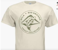
Green logo on ivory

GRG-TU Logo T-shirts to support local trout restoration and conservation efforts.