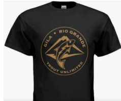
Peanut butter logo on black

Our beautiful T-shirts with the GRG-TU logo in colors: green-on-ivory, and peanut-butter-on-black are sold as part of our fund-raising for trout restoration and conservation efforts. These are great looking, well-made shirts for a great cause at only $20 each. Please include $5 for shipping