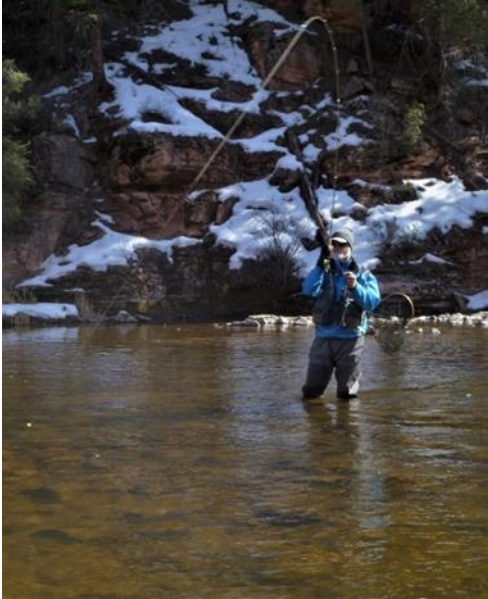
Late winter fishing on the Frying Pan River near Basalt, CO.

water is nice and cold, and most anglers stay home in the winter, so you'll have lots of water to yourselves. So, until we see you at the Annual Banquet, get out there and catch some trout.