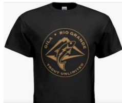
Peanut butter logo on black

Our beautiful T-shirts with the GRG-TU logo in colors: green-on-ivory, and peanut-butter-on-black are sold as part of our fund-raising for trout restoration and conservation efforts. These are great looking, well-made shirts for a great cause at only $20 each. Please include $5 for shipping if you want the shirt(s) mailed. Contact Jeff Arterburn to get yours, and to sign up for the next volunteer event: mailto:jeffgilatu@aol.com .