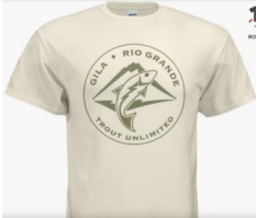
Green logo on ivory

GRG-TU Logo T-shirts to support local trout restoration and conservation efforts.