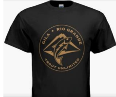
Peanut butter logo on black

Our beautiful T-shirts with the GRG-TU logo in colors: green-on-ivory, and peanut-butter-on-black are sold as part of our fund-raising for trout restoration and conservation efforts. These are great looking, well-made shirts for a great cause at only $20 each. Please include $5 for shipping if you want the shirt(s) mailed. Contact Jeff Arterburn to get yours, and to sign up for the next volunteer event: mailto:jeffgilatu@aol.com .