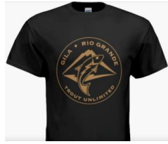
Peanut butter logo on black

Our beautiful T-shirts with the GRG-TU logo in colors: green-on-ivory, and peanut-butter-on-black are sold as part of our fund-raising for trout restoration and conservation efforts. These are great looking, well-made shirts for a great cause at only $20 each. Please include $5 for shipping if you want the shirt(s) mailed. Contact Jeff Arterburn to get yours, and to sign up for the next volunteer event: mailto:jeffgilatu@aol.com .