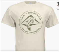
Green logo on ivory