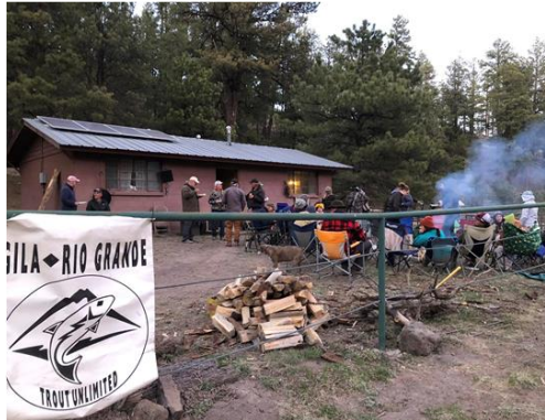
Dinnertime for the volunteer crew

GRG-TU Logo T-shirts to support local trout restoration and conservation efforts.