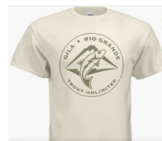
Green logo on ivory