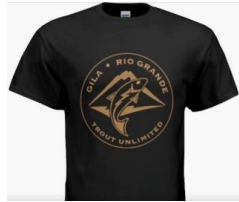
Peanut butter logo on black

Our beautiful T-shirts with the GRG-TU logo in colors: green-on-ivory, and peanut-butter-on-black are sold as part of our fund-raising for trout