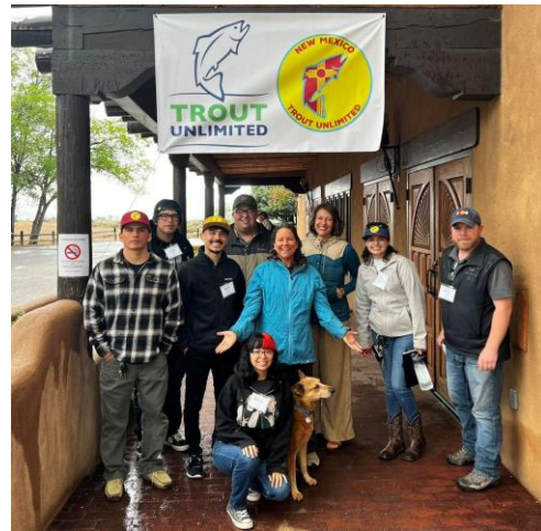
NMSU CMI Gila Film School Students and Faculty attending the TU WRR in Taos

State University were the stars of the show and received a great reception during the kickoff film night event at the Taos Center of the Arts. Three