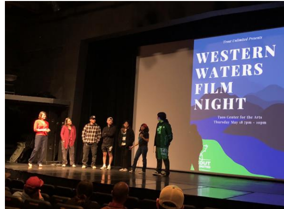
NMSU CMI Gila Film School Students on Stage at the TU WRR in Taos