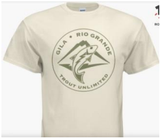
Green logo on ivory

GRG-TU Logo T-shirts to support local trout restoration and conservation efforts.