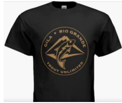
Peanut butter logo on black

Our beautiful T-shirts with the GRG-TU logo in colors: green-on-ivory, and peanut-butter-on-black are sold as part of our fund-raising for trout restoration and conservation efforts. These are