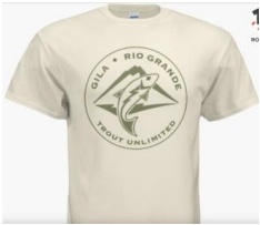
Green logo on ivory

GRG-TU Logo T-shirts to support local trout restoration and conservation efforts.