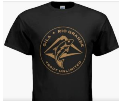
Peanut butter logo on black

Our beautiful T-shirts with the GRG-TU logo in colors: green-on-ivory, and peanut-butter-on-