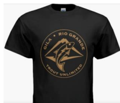
Peanut butter logo on black

Our beautiful T-shirts with the GRG-TU logo in colors: green-on-ivory, and peanut-butter-on-