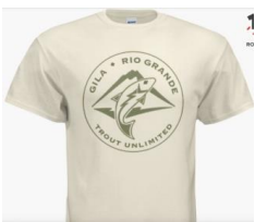
Green logo on ivory

GRG-TU Logo T-shirts to support local trout restoration and conservation efforts.