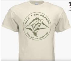
Green logo on ivory

GRG-TU Logo T-shirts to support local trout restoration and conservation efforts.