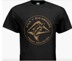
Peanut butter logo on black

Our beautiful T-shirts with the GRG-TU logo in colors: green-on-ivory, and peanut-butter-on-black are sold as part of our fund-raising for trout restoration and conservation efforts. These are great looking, well-made shirts for a great cause at only $20 each. Please include $5 for shipping if you want the shirt(s) mailed. Contact Jeff Arter