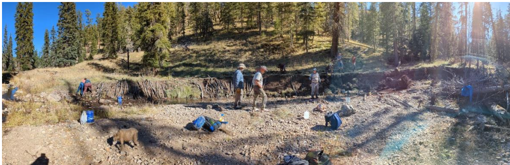
Panorama view of the TU and WNMU Student volunteers installing willow bundles to repair the problem cutbank and split channel in lower Turkey Creek.