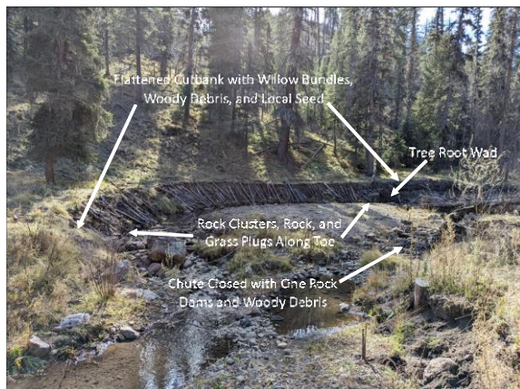
Cutbank restoration using willow bundles (Photo and annotation by Kent Johnjack).

The accompanying photographs 1–6 are included to give you more detail about the process used to restore a cutbank. Post-fire flooding and erosion has obviously damaged the stream, and sedimentation created a mid-channel bar, forcing flow to split with one thread against the bank and the other thread through a cutoff chute. To promote formation of a single longer channel with less energy, the cutoff chute was closed with a rock vane at the head and one rock dams with woody debris along its path. The nearly vertical eroded cutbank was flattened with plantings of 6–8' long willow bundles (5–6 poles). The toe was stabilized with rock and grass plugs relocated from the top of the flattened bank. Rock clusters were added along the toe for habitat diversity. The expectation is that a pool or pools will form along the restored bend.