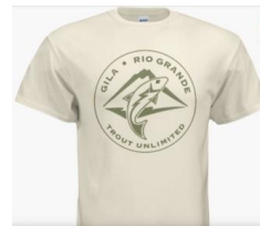
Green logo on ivory

GRG–TU Logo T-shirts to support local trout restoration and conservation efforts.