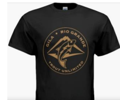
Peanut butter logo on black

Our beautiful T-shirts with the GRG–TU logo in colors: green-on-ivory, and peanut-butter-on-black are sold as part of our fund-raising for trout restoration and conservation efforts. These are great looking, well-made shirts for a great cause at only $20 each. Please include $5 for shipping if you want the shirt(s) mailed. Contact Jeff Arterburn to get yours, and to sign up for the next volunteer event: mailto:jeffgilatu@aol.com .