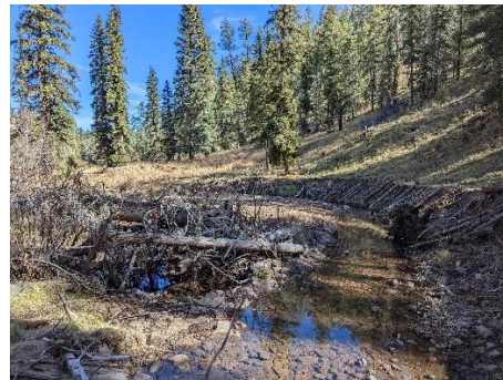
Downstream view of repairs on cutbank and split channel in lower Turkey Creek.