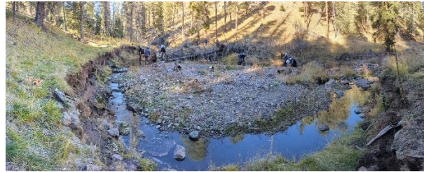
Panorama view of the problem cutbank and split channel in lower Turkey Creek with YCC Team Members starting rock work.