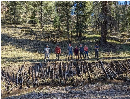
TU and WNMU Student volunteers after installing 13 willow bundles to repair the problem cutbank and split channel in lower Turkey Creek.