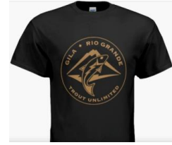
Peanut butter logo on black

Our beautiful T-shirts with the GRG-TU logo in colors: green-on-ivory, and peanut-butter-on-black are sold as part of our fund-raising for trout restoration and conservation efforts. These are great looking, well-made shirts for a great cause at only $20 each. Please include $5 for shipping if you want the shirt(s) mailed. Contact Jeff Arterburn to get yours, and to sign up for the next volunteer event: mailto:jeffgilatu@aol.com .