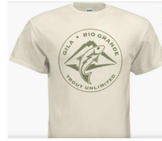
Green logo on ivory

GRG-TU Logo T-shirts to support local trout restoration and conservation efforts.