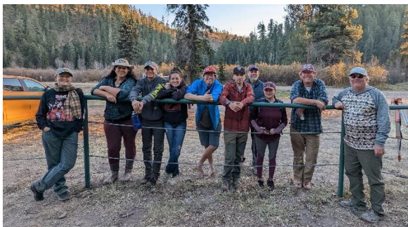
Volunteer Work Crew for Little Turkey Creek Project Gila National Forest

conditions and stream flows to make sure we can get in there safely. We are planning to plant willow poles and bundles and will need to inspect and do maintenance on existing rock and log structures along with some new construction. Participants will arrive Thursday and work full days Friday and Saturday. We provide delicious hot camp meals for breakfast and dinner, with sandwiches for lunch, starting Thursday night through Sunday breakfast. It's a lot of fun and very rewarding to be part of a team working to restore stream habitat in this beautiful watershed for Gila trout. We need an accurate head count in order to plan the food so please reach out to one or more of us on the leadership team and we will add you to the list for planning and communications (send an email to Jeff Arterburn, Las Cruces < jeffgilatu@aol.com >, Jim Brooks, Albuquerque < arroyodejaime@gmail.com >, and/or Eric Head, Silver City < eric.head@tu.org > ). For additional information Eric Head wrote an article for the December 27 th edition of the TU weekly E-newsletter Trout Weekly describing ongoing efforts titled "Another serving of Turkey (Creek) for the Gila Centennial. Here's the link: https://www.tu.org/magazine/conservation/restoration/another-serving-of-turkey-creek-for-the-gila-centennial/?utm_source=informz&utm_medium=email&utm_campaign=none&_zs=m0CCb&_zl=2cSs3