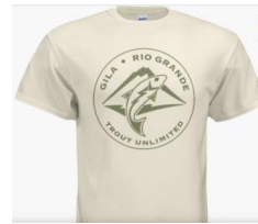
Green logo on ivory

GRG-TU Logo T-shirts to support local trout restoration and conservation efforts.