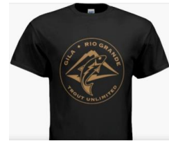
Peanut butter logo on black

Our beautiful T-shirts with the GRG-TU logo in colors: green-on-ivory, and peanut-butter-on-black are sold as part of our fund-raising for trout restoration and conservation efforts. These are great looking, well-made shirts for a great cause at only $20 each. Please include $5 for shipping if you want the shirt(s) mailed. Contact Jeff Arterburn to get yours, and to sign up for the next volunteer event: mailto:jeffgilatu@aol.com .