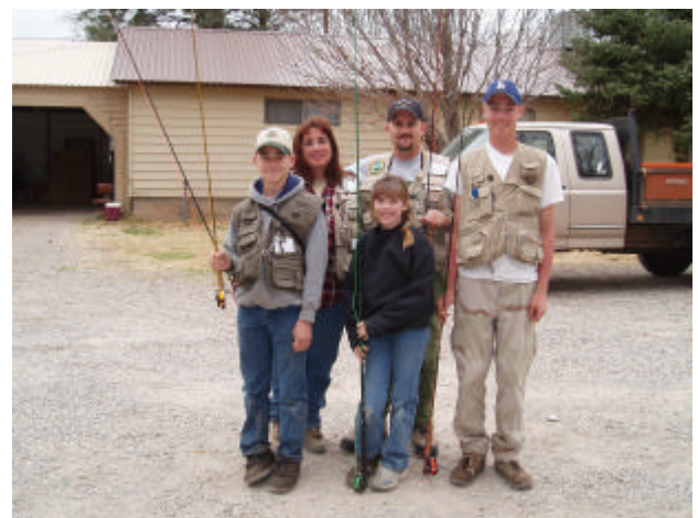
The Vallee Family