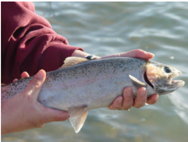
Randall Vallee caught this nice one on the Rio Chama.