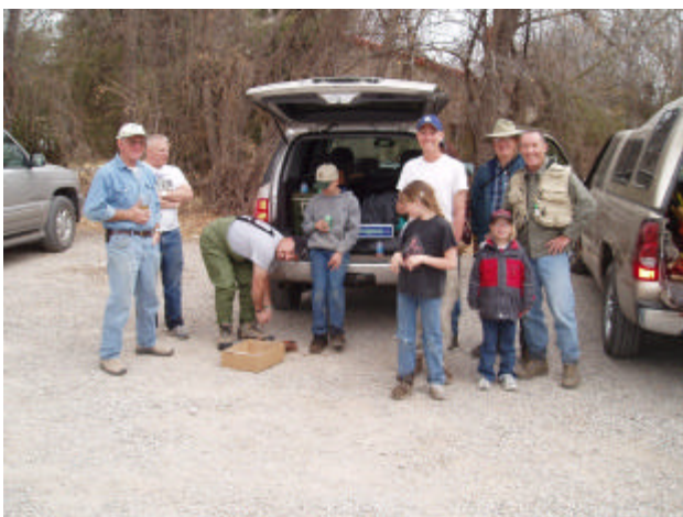
Time to relax after a job well done.