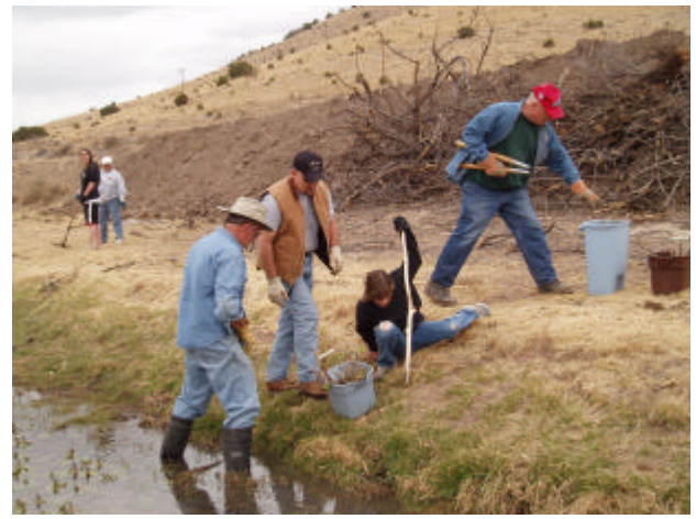
Be sure and plant them close to the water.