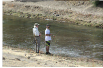
More Fishing at the Lease on next page.

<> <> <> <> <> <> <> <> <> <> <> <> <> <> <>