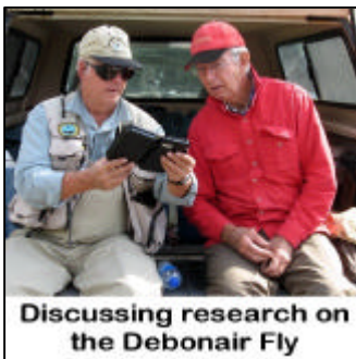
Discussing research on the Debonair Fly

The first morning, with no malice intended, Jim 2 observed how poorly we were representing the MVFF and mused that maybe an entrance exam was necessary to separate the "wheat from the chaff". There was various talk of required testing to include identification of 100 important flies, an entomology exam, and a course in reading good trout lies for starters. Over the next several days we began to realize the importance of these skills as Jim 2 began to provide our basic education.