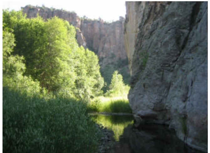
West Fork of the Gila