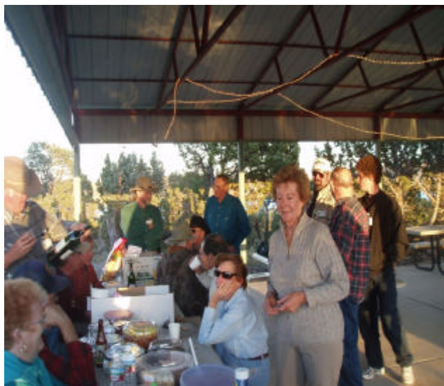
Dinner at the Pine Tree Campground San Juan Trip - October 2004

We will begin a monthly Liars and Tiers session on the last Thursday of each month beginning December 30, 2004 at the New Mexico Game and Fish Conference Room where we have the regular monthly meetings. Bring any materials and tools that you may have. Materials and tools will be