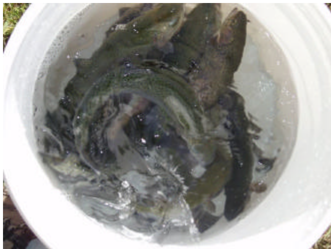
A Bucket Full of Rainbows

On November 6, about 350 rainbows were stocked at the lease. The fishing has steadily improved since the heavy rains from the late summer and early fall have ended. Recently a member reported catching an 18 inch brown. Give the lease a try over the holidays, but keep an eye on the weather.