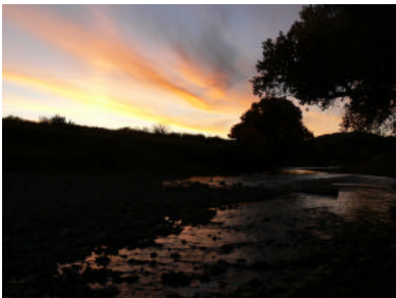
Sunset over the Rio Peñasco

The weather was great and we were treated to a fantastic sunset, and we had two especially noteworthy catches that are worth reporting. Shortly after noon, I hooked a rainbow double: one on the hopper and another on the dropper at the same time. I saw both fish come off the bottom after the flies, nearly colliding in the process; the smaller (10-11") took the hopper while the chunky 15 incher slugged the dropper. With the fish pulling in different directions, the smaller one was able to release itself, but I landed the one on the dropper. Later in the afternoon after finding some nicks in my leader, I tied on a new one and switched to fluorocarbon, just in case there was a big one lurking under the bank somewhere. It was a fortunate choice. On my first cast with the new leader, I hooked into the largest fish I've caught in this region, a 21+ inch brown. It was hooked on a #16 flash back PT, and after it made four powerful runs and a couple of attempts to break me off on rocks, I finally netted the beauty. [I was using a March Brown Hidden Waters 9ft, 4wt rod, a seven piece travel/backpack rod that packs down to about 16 inches. I'm a field rep for March Brown, so if you're interested in seeing this or other models of their rods, you can contact me through the club.] I've attached a photo of the brown, and the beautiful sunset that finished off an extraordinary day.