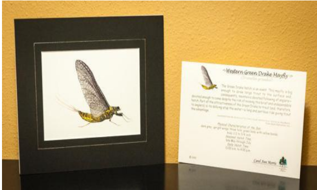
Wester Green Drake, watercolor/pen & ink Giclee print

ed an example of a Western Green Drake dun here as an example of the sort of exquisite work you can expect to see at our banquet. I hope you will make plans to attend what is shaping up to be an exciting and interesting event.