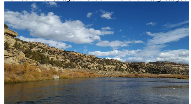
Waders and drifters working through the Lower Flats