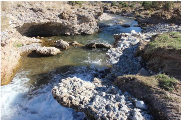
Facing downstream looking over what is left of the lower falls on the lease waters (the lip of the falls used to be about in the center of this photo)

When you next visit the lease, be prepared to become acquainted with a different river. The flood removed much of the silt and aquatic vegetation, has reconfigured many of the banks, and created new boulder runs and pockets of holding water where we didn't have them before. The lower waterfall is essentially