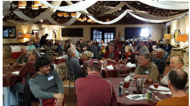
During the raffle at the F3T event at Ardivino's Desert Crossing