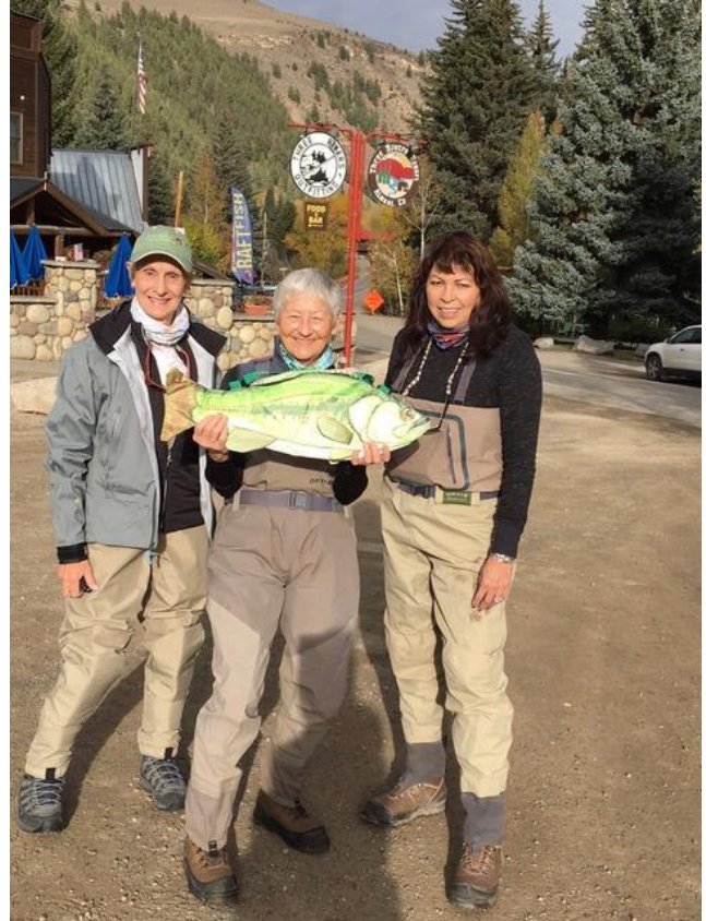
A rare Cervisia Sacculus Lake Trout caught in the Gunnison River.