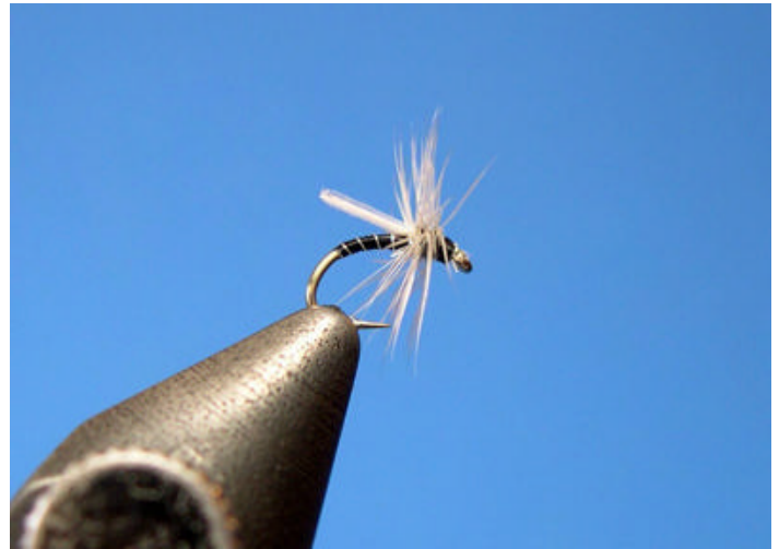
Tak's Biot Winged Midge Adult