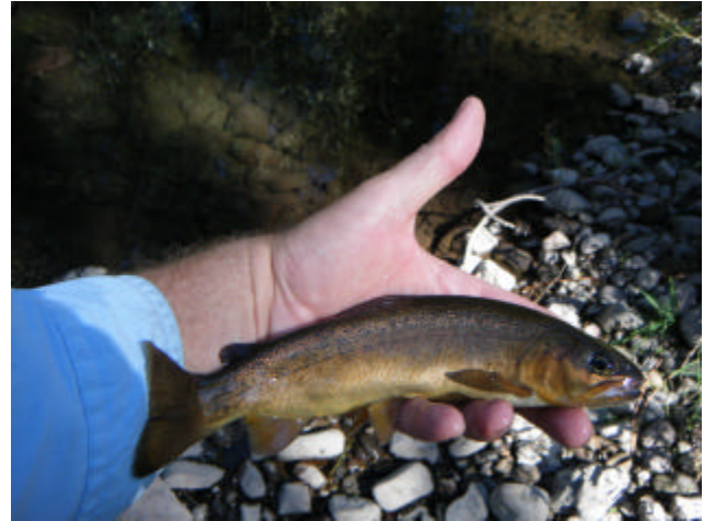
Black Canyon Gila Trout