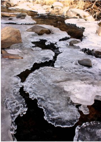
Ice formations on Upper Cow Creek

mountain mahogany are leafless spindles that provide little visual cover. The higher water flows of summer and early fall are greatly diminished; what were once