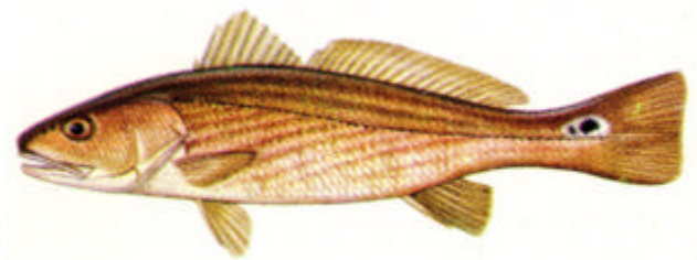
Red Drum aka Redfish