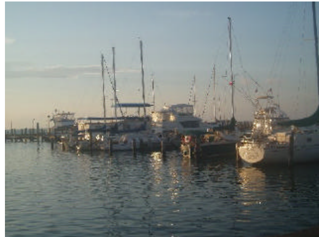
Fishing Boats at Port Aransas