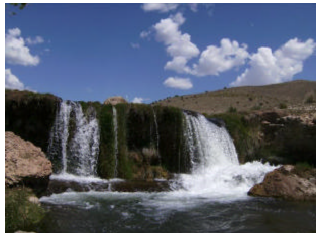
Lower Waterfall on the Lease