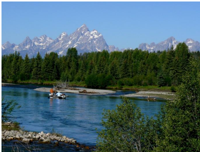
Snake River, Grand Teton National Park.... A good place for oil and gas drilling?

was first passed in 1972, the Clean Water Act was intended to apply protections to our rivers, streams and water supplies by preventing the discharge of pollution into the "waters of the United States." For 30 years, the protected waters included wetlands and headwaters which are so vital to the health of our fisheries. In 2002, during the second Bush administration, the legislative intent of the law was circumvented in favor of mining interests, by changing the definition of "waters of the U.S." to mean only those rivers that are large and deep enough to permit commercial transportation. As a result, most of the nation's streams and wetlands were no longer protected, and wetland losses were on the increase for the first time since the 1980s. Between 2004 and 2009, the rate of wetland loss increased by 140 percent over the rate measured between 1998 and 2004. In response, the EPA spent more than a decade developing the Clean Water Rule that would restore protections to some of the streams, wetlands and ponds that had been excluded during the Bush administration. The proposed Clean Water Rule was completed