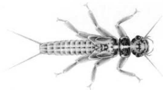
Western Yellow Stonefly ( Isoperla marmona )

<> <> <> <> <> <> <> <> <> <> <> <> <> <> <> <>