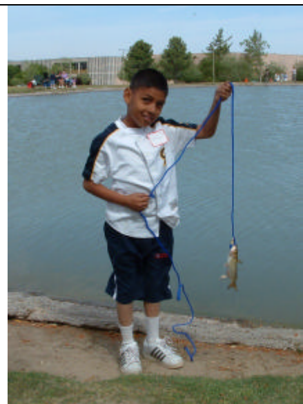
Kid's Fishing Clinic