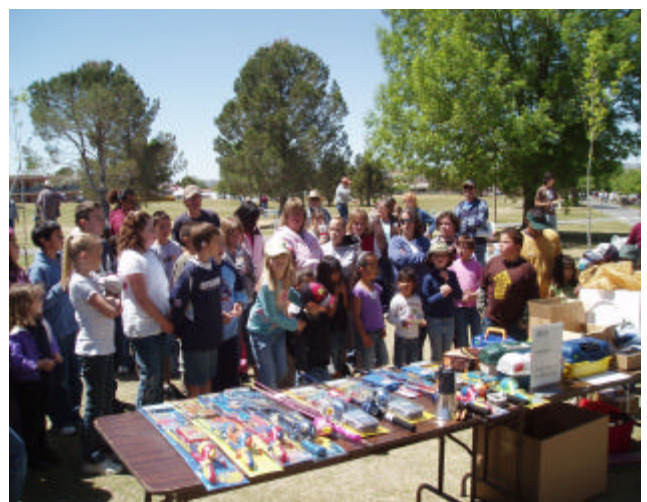
Lots of prizes - every kid received one