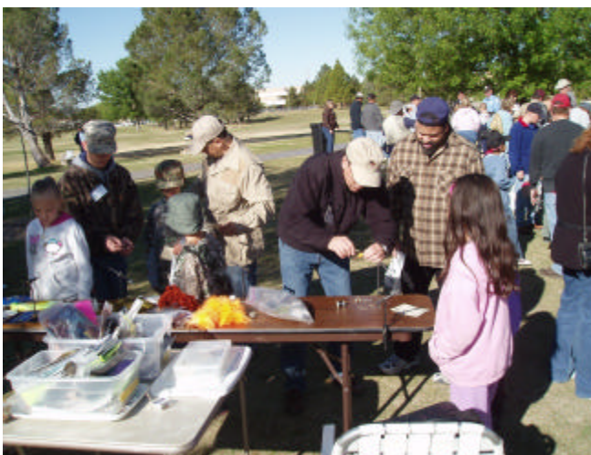
Beautiful day - Lots of kids - Great time for all