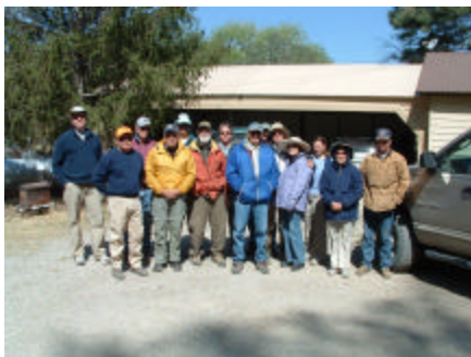
The Stocking Crew