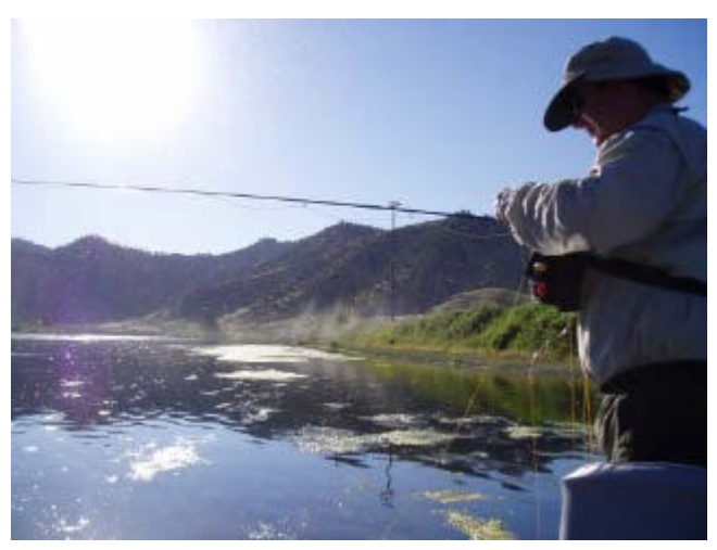
Enjoying the solitude.

It's true that I had more to shake out than the dust of 1,300 miles and a couple of months in the hole without fishing. Averting the temptation to blindly cover the rich water