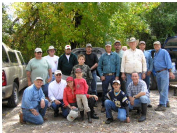
The stocking crew