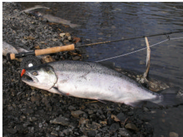
A nice silver showing the fly that was his demise.

<> <> <> <> <> <> <> <> <> <> <> <> <> <> <> <> <> <>